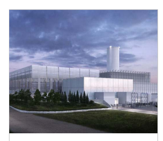
BOND Begins Sitework at Salem Harbor Energy Center