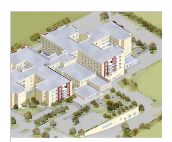
Milestone for CT's First 'Household Model' Nursing Home