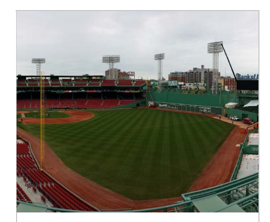
Gilbane Completes 2015 Fenway Park Spring Improvement Program